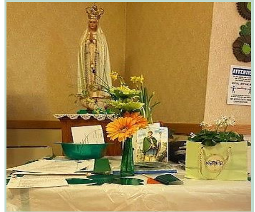
Figure 1: Beautiful props for our Irish Day Celebration!